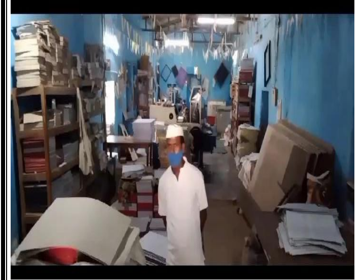
PAPER MILL AND PRINTING AREA IN CENTRAL JAIL, AMBIKAPUR