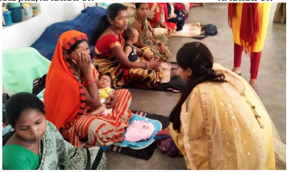
A STUDENT INTERACTING AND SHARING THE PAIN OF A WOMAN CRIMIAL