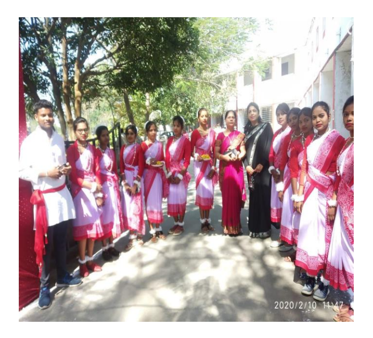
WELCOME PRORAMME BY THE STUDENTS FOR NEW COMERS