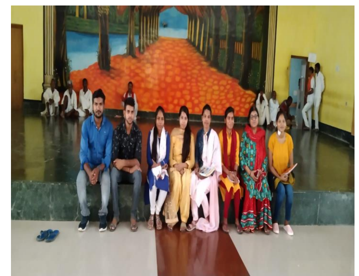
GATHERING HALL AT CENTRAL JAIL, AMBIKAPUR