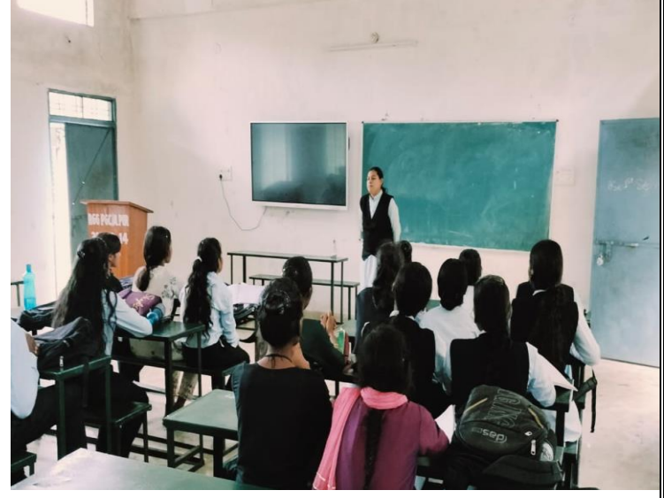
PEER TEACHING BY UNDERGRADUATE STUDENTS (2022-23)