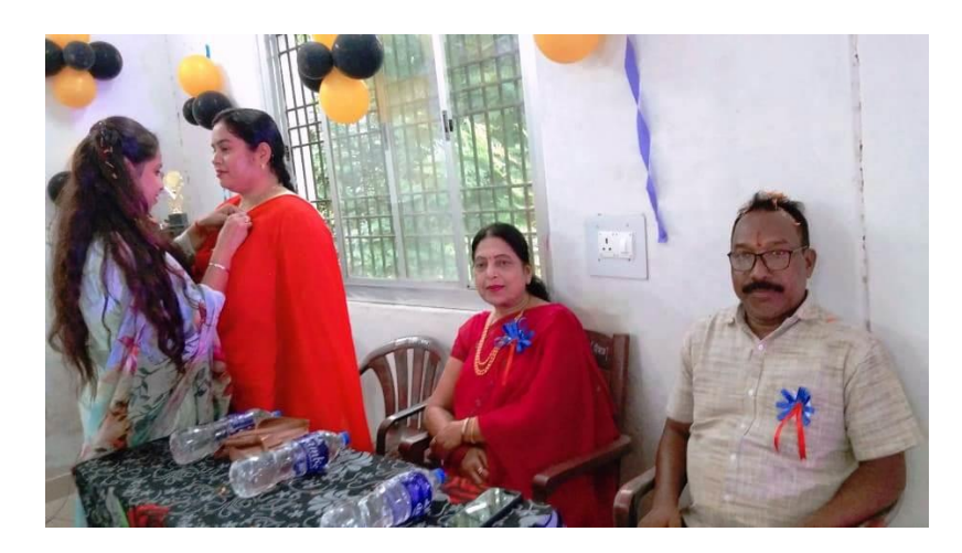
A CAPTURE FROM ANNUAL FUNCTION AND PRIZE DISTRIBUTION CEREMONY