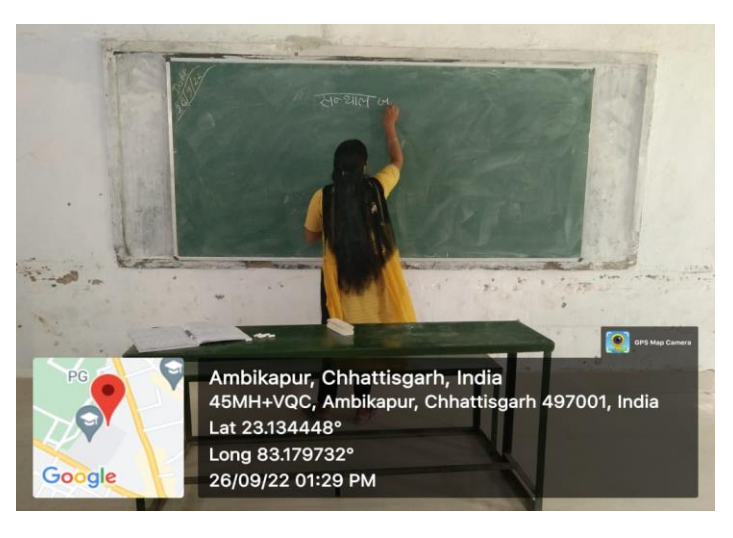
PEER TEACHING BY PALAK SHRIVASTAV (2022-23)