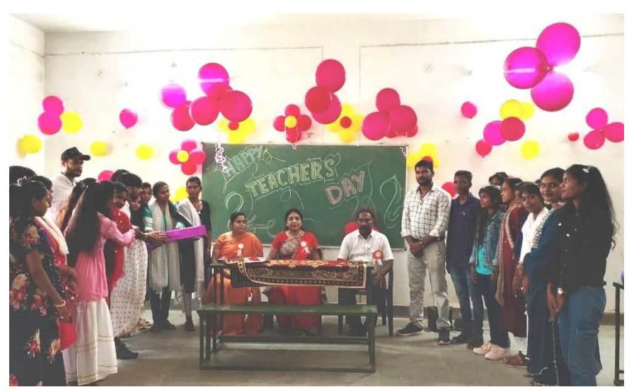
CELEBRATION OF TEACHER'S DAY BY THE STUDENTS