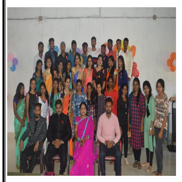
STUDENT FAREWELL CELEBRATION (Batch 2019-20)