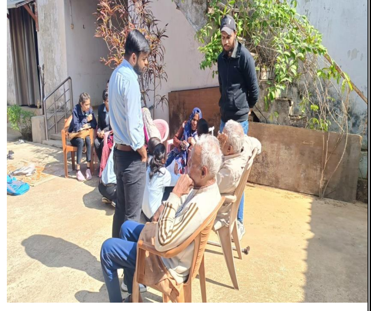
GROUP PHOTO AT THE OLD AGE HOME, AJIRMA, AMBIKAPUR